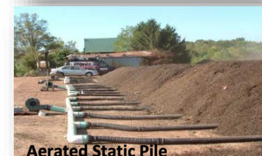
Aerated Static Pile